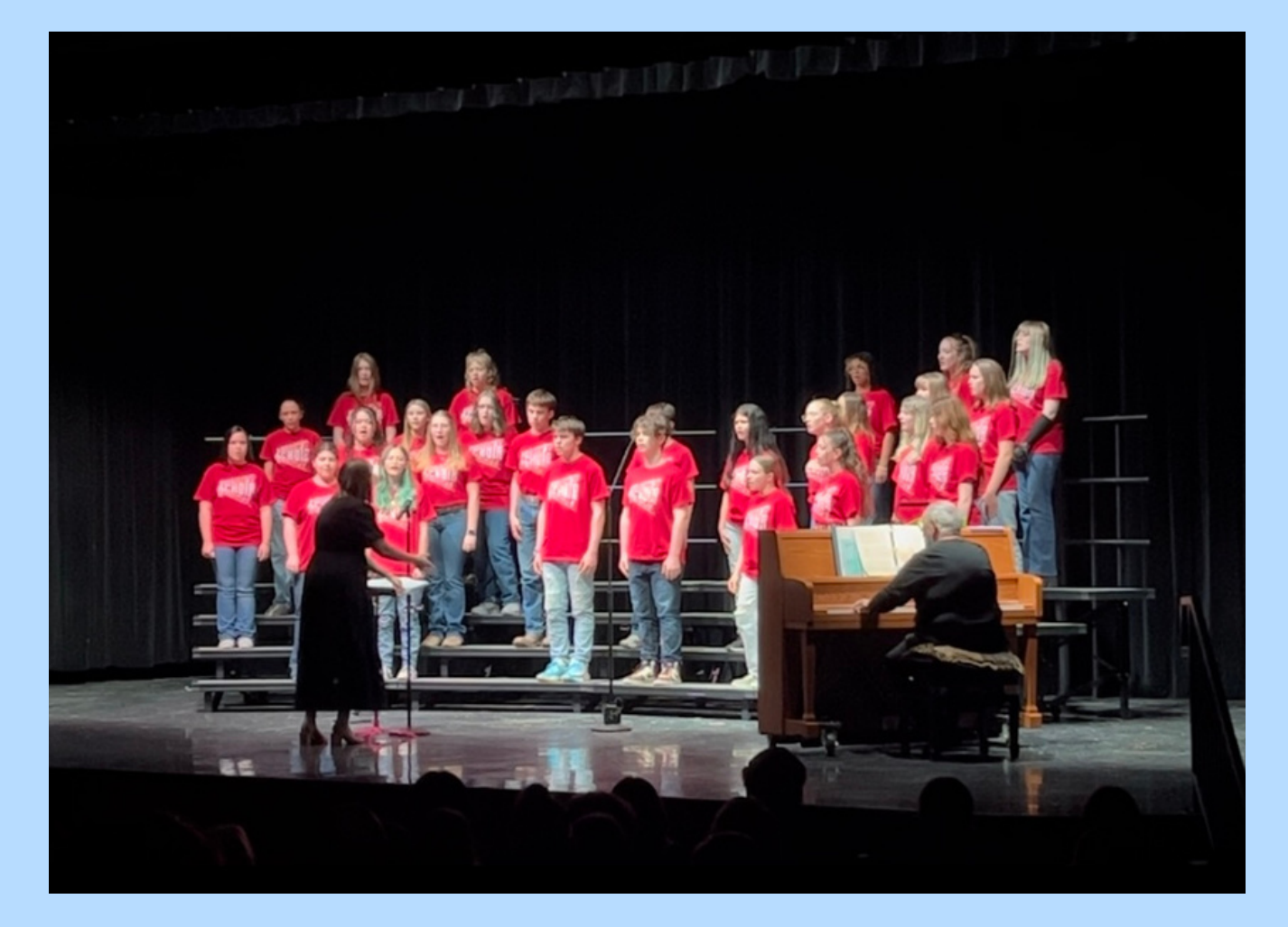
JH Choir at their Combined Concert at SFTHS on March 6th.

able to perform songs as a whole group and as individuals!